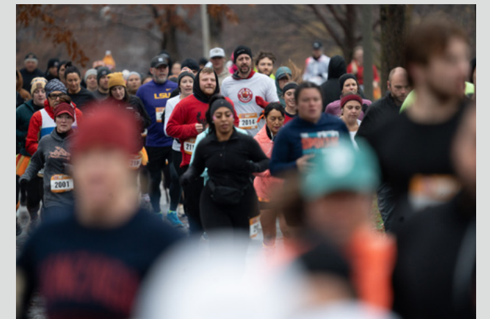
Rain and cold cannot dampen our community spirit!

The 3rd annual Give NCW Turkey Trot drew over 1,700 runners (including 188 kids!) and at least 150 canine companions to kick off the campaign on a cold, wet Thanksgiving morning, proving that community spirit can't be dampened. The event raised $37,421 for the campaign's Give To All match fund and generated energy and awareness for the 98 participating nonprofits. Supported by sponsors including Wenatchee Valley Medical Group, Cordell Neher & Co., and Cashmere Valley Bank, the Turkey Trot has become a cherished part of our region's holiday tradition.