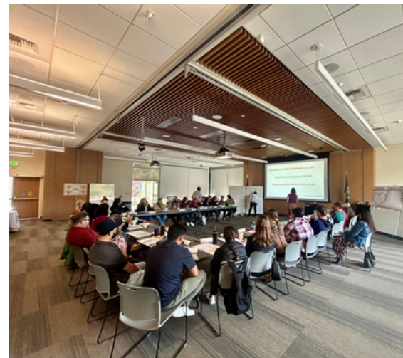
Leadership Institute Summit

The impact of the program lives on through its graduates. Many are finding their voice and their role serving their communities through advocacy, volunteerism, and leadership values rooted in lived experience.