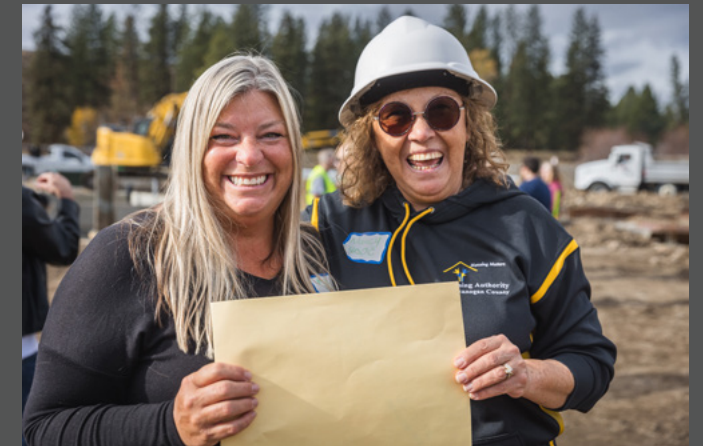
Onsite at the Housing Authority of Okanogan County's groundbreaking in Winthrop