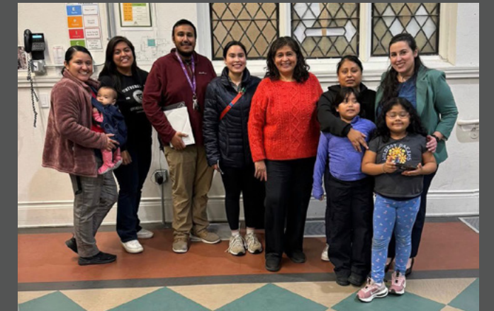
Families served by Northwest Immigrant Rights Project

All of our services are provided free of cost, including legal representation, community education, and system advocacy; ensuring that everyone can access support regardless of their financial situation or where they were born.