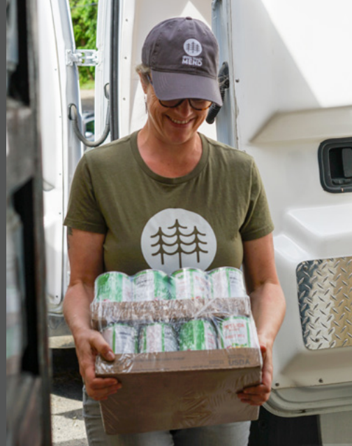
Volunteers bring relief to those affected by the storm.

“The Community Foundation is like a deep exhale.”